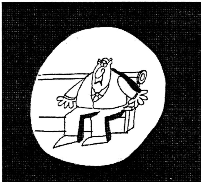
"We're in need of a volunteer!"