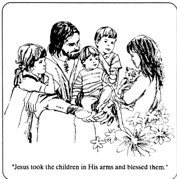
"Jesus took the children in His arms and blessed them."

The next Newsletter deadline will be March 26. Any information recieved after this date will not be included. Thank-you ALL for cooperating with the deadlines.