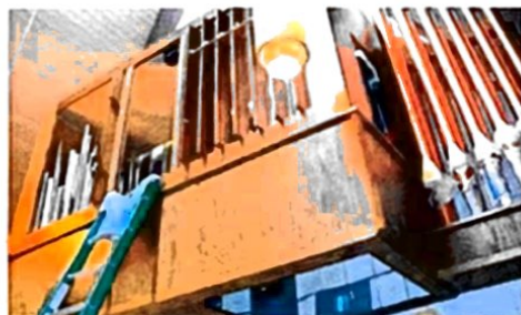
Putting in the pipes.