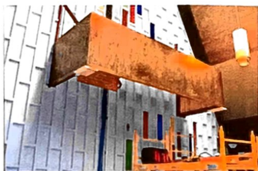
Beginning installation, putting up the Swell Box