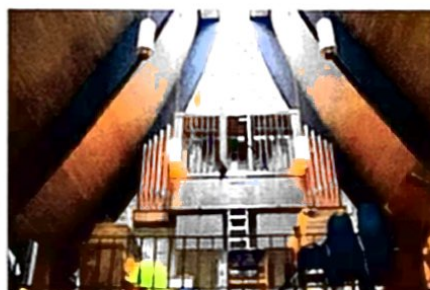
All in, ready for final touches.