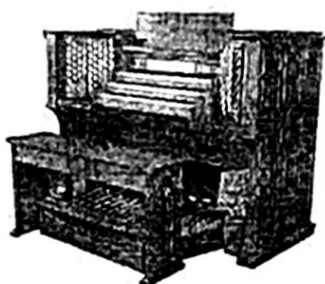
harmonic and scaling detail of a real pipe organ.

Known for rich sound through real-time sampling technology, JOHANNUS captures every