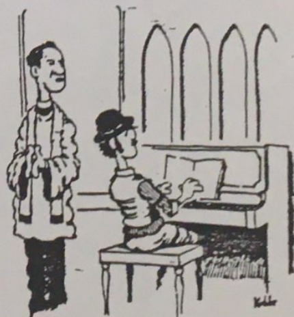
"As you may have noticed, our minister of music is back from his vacation in New Orleans."

O.H.S. in Iowa: performances on historic American instruments recorded during the 1986 Organ Historical Society conclave in Iowa.