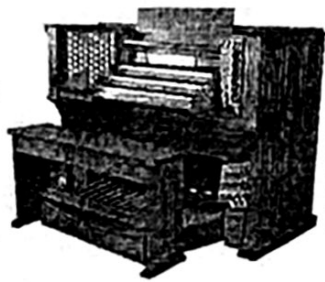
harmonic and scaling detail of a real pipe organ.

Known for rich sound through real-time sampling technology, JOHANNUS captures every