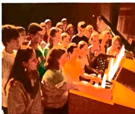
Piano students in the Intro to Organ class

We had a great schedule. Because there were six students and six organs, each student was able to practice 3 1/2 hours per day as well as receive a daily half hour lesson with me. In addition to their organ studies, the students joined the IMC piano students daily for a one hour music history class, a one hour harmony class, and a one hour theory class. Each evening, the organ and piano students received a master class presented by a different member of the piano faculty. Every day I taught a one hour "Organ for Pianists" class for the piano students. The organ scholarship students demonstrated what they were learning to the piano class and on Friday performed their recital pieces for the class. I'm sure the organ students inspired some of the piano stu-