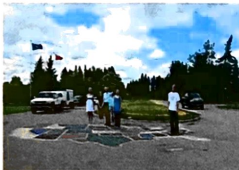
Standing in their home states and provinces at the Peace Garden entry

International Music Camp, Peace Gardens: Our 2008 Organ Camp held from July 6-12 at the International Music Camp, sponsored once again by Rodgers Instruments, was WONDERFUL! Rodgers provided full tuition, room, and board scholarships for six students and paid for my salary and the cost of bringing organs to camp. The students were from Georgia, Minnesota, North Dakota and Manitoba.