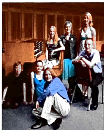
IMC Organ Class, 2008