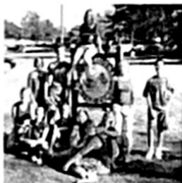
International Music Camp at the Peace Gardens

The organ program at the International Music Camp (IMC) at the Peace Gardens between the border of North Dakota and Manitoba has been expanding over the past few years through the sponsorship of ten full-tuition and board scholarships by Rodgers Instruments LLC, Hillsboro, OR.