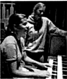
Four of the 10 scholarship students were from ND. These students are from Our Saviors Lutheran Church in Park River.

The program is designed primarily to help pianists make the transition to the organ. Scholarship students were required to have completed level four of piano. Students were selected by a committee at Rodgers Instruments LLC based on audition