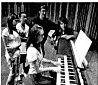
Organ students watching a classmate play

Minnesota, Ohio, Wisconsin, and Saskatchewan attended the camp.